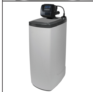
Low profile cover available

Cabinet Available Colors: Light Gray/Dark Gray Combination Light Gray/Blue Combination