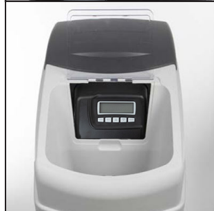
Top sliding cover and flip up access window