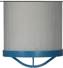
Opposite end of filter