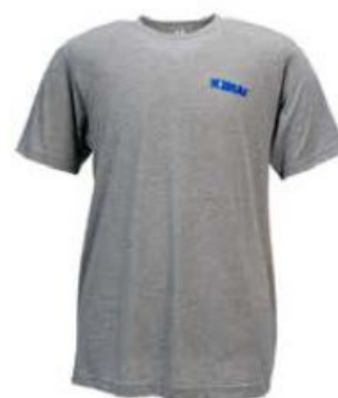
T-Shirt S, M, L, XL, 2X $14.00