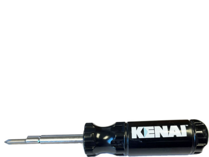
6-in-1 Screwdriver Multi-tool $20.00