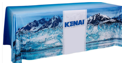
Co-branded Table Cover $200.00