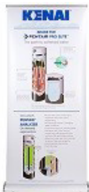
Pull Up Banner $250.00