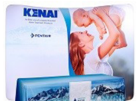
Tradeshow Backdrop $1200.00