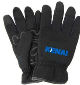
Mechanic Gloves - L /XL $25.00