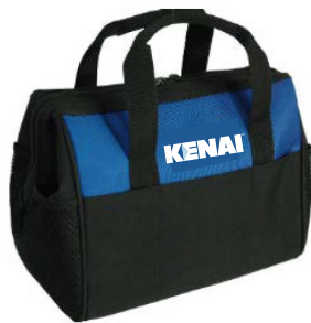
Tool Bag $25.00