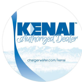
Window Decal $12.00