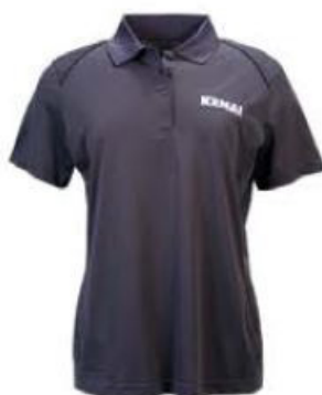
Women's Polo XS, S, M, L $38.00