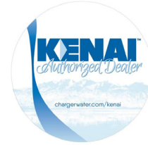
Vehicle Magnet (2) $25.00