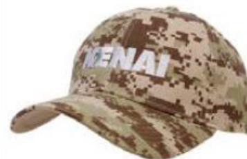
Camo Hat $18.00