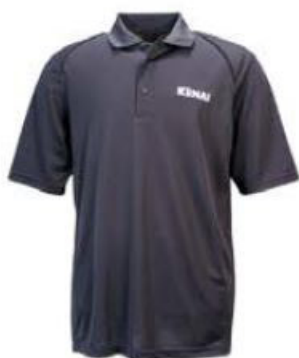
Men's Polo S, M, L, XL, 2X $45.00