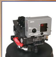
455 460i/460TC SERIES

Save water and up to 40% in salt usage by adding meter-controlled regeneration to your unit.