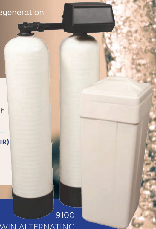
9100 TWIN ALTERNATING HI-FLOW SERIES

Save water and up to 40% in salt usage by adding meter-controlled regeneration to your unit.