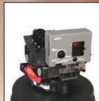
455 460i/460TC SERIES

Save water and up to 40% in salt usage by adding meter-controlled regeneration to your unit.