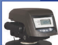
268 Performa Logix SERIES

Save water and up to 40% in salt usage by adding meter-controlled regeneration to your unit.