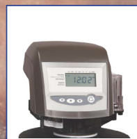
474/476 Logix SERIES

Save water and up to 40% in salt usage by adding meter-controlled regeneration to your unit.