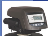
268 Performa Logix SERIES