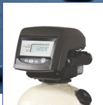
FILTER PREP 263 1" CONTROL VALVE